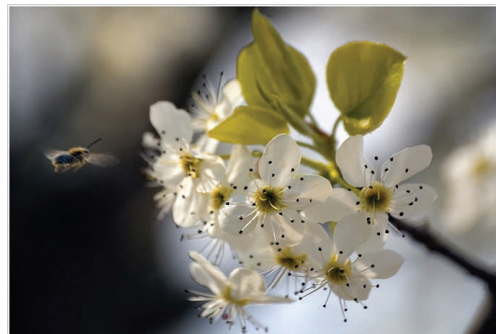
Honey Bee w/Bradford Pear Bloom @ McIntosh Reserve Park

Quiet time for campers begins at 10 pm and continues until 7 am. Pets are allowed, but must be in control of the owner at all times. Dogs should be on leashes at all times. Horses should be not be tied to individual trees which could result in damage to the tree.