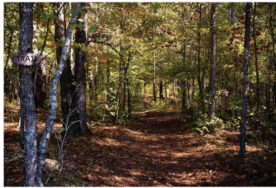
One of many trails at McIntosh Reserve

The Park office is open year round except for Thanksgiving Day, Christmas Day, and New Years Day. Park office hours are 8 am until 5 pm daily. Park hours are 8 am until 8 pm (Summer) and 8 am until 7 pm (Winter). All visitors not camping must leave the park after day use hours as the gate is then locked until 8 am the next day. Pavilion reservations may be made by phone or in person M-F from 8 am until 5 pm. A deposit is required to hold the reservation and must be received within 10 days. Camping is on a first-come, first serve basis. Picnic tables not occupied by campers are available on a first come first serve basis.