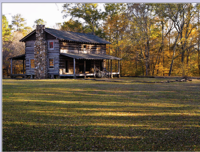
McIntosh House @ The Reserve

Over 1,000 nominations were submitted and 356 of those were selected throughout the coverage area.